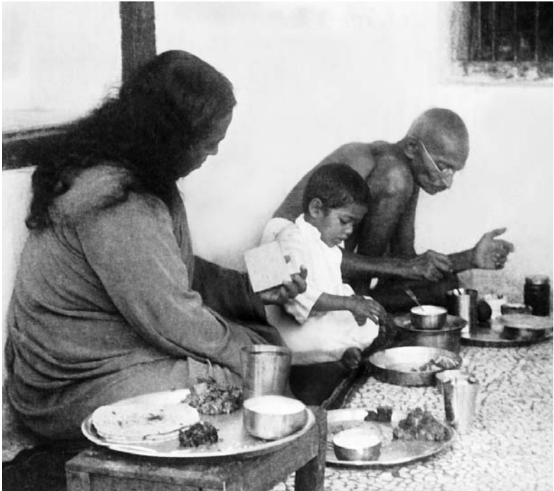
Paramahansa Yogananda and Mahatma Gandhi Wardha, India, 1935

meditation groups. If you are unable to attend these services, or if you are a follower of another spiritual teaching, you may wish to have a private service each week in your own home (see instructions on page 20). As mentioned earlier, the basic principles of prayer and healing described in this booklet are applicable by anyone, regardless of religious affiliation. If you wish to participate in the Self-Realization Fellowship Worldwide Prayer Circle, please see the registration form at the back of this booklet.