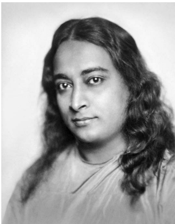
PARAMAHANSA YOGANANDA (1893-1952)